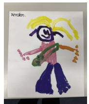
Xerden - Kindy Kian - Year 5 Tenzin - Year 5 Nigtob - Year 6